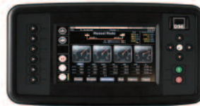
DSE8721 Colour Remote Display Module