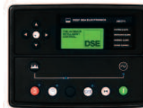
DSE871X Standard Remote Display Module